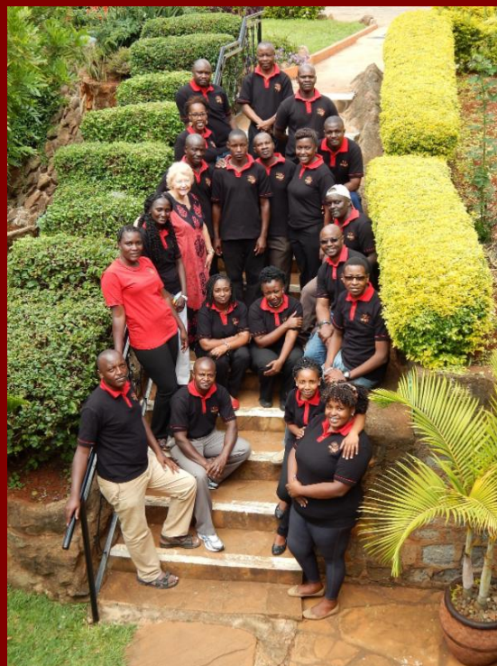
Kenya HEART staff 2017